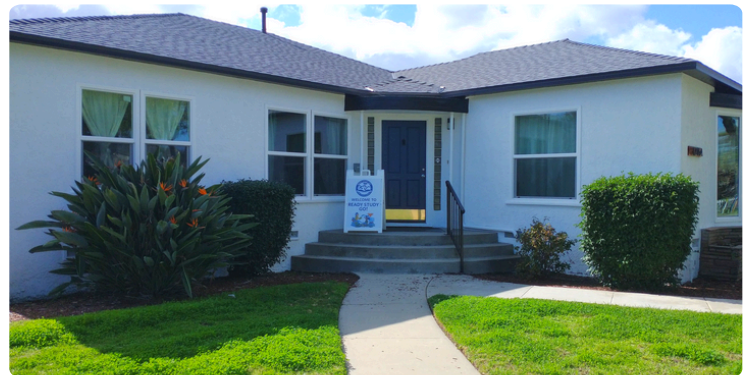
Ready Study Go: Premier Academy 18325 Horst Ave, Artesia, CA 90701